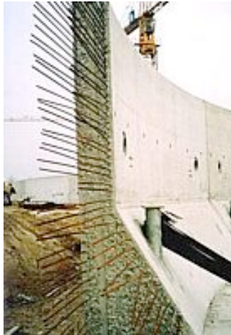
10. Completed wall section with transition piece after stripping of formwork