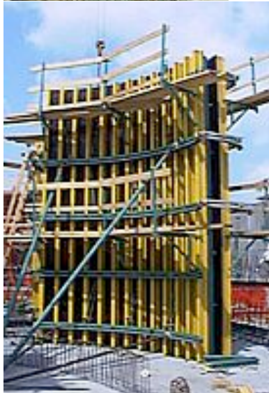
11. RSB special segment formwork for baffles