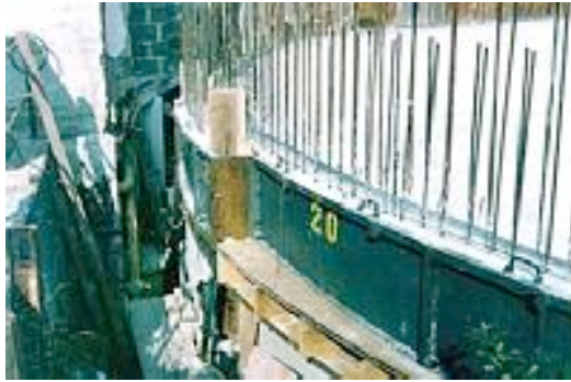
5. External formwork with special buttress design