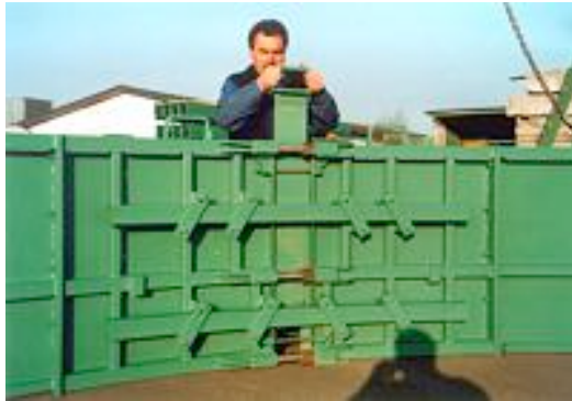
6. Wedge element for closing the interior formwork