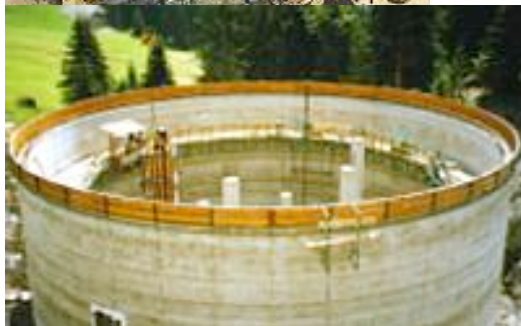
8. RSB industrial formwork with wooden formwork skin (for diameters above 18 m)