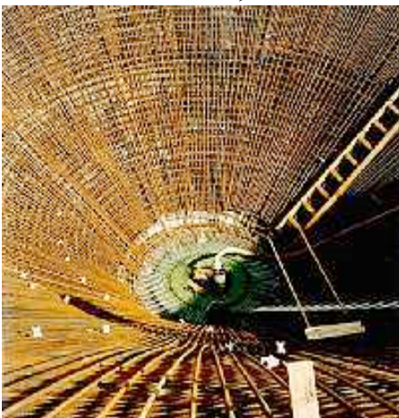
Reinforcement work, installation of inserts