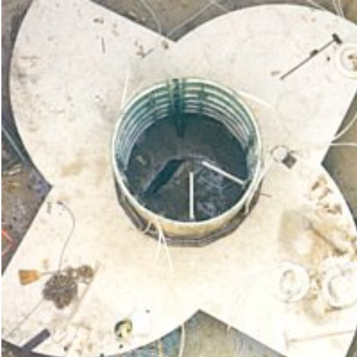
6. Completed mixing blades