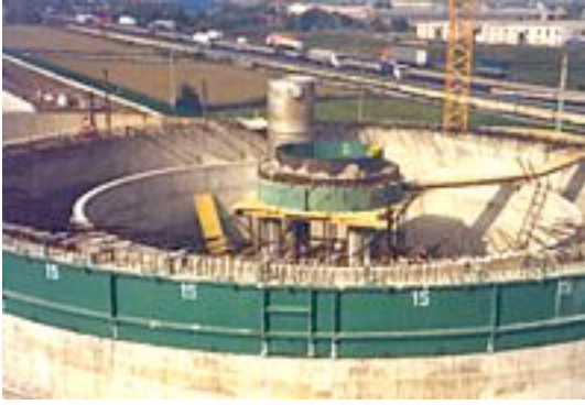
5. Cylinder and overflow chamber complete