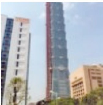
Taipei 101, Taipei, Taiwan